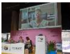
Ms Yvonne Aki-Sawyerr, Mayor of Freetown, City of Freetown, Sierra Leone